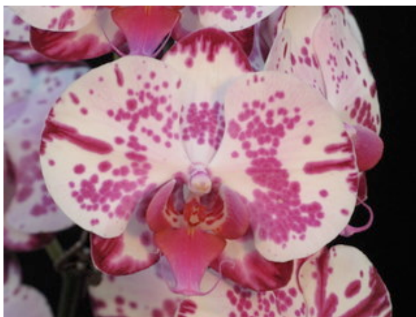
Phal Yu Pin Lady 'Yu Pin Lady' HCC/AOS