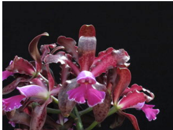
Cattelya Mareeba Tiger 'Mem. Honore Bourgeois'