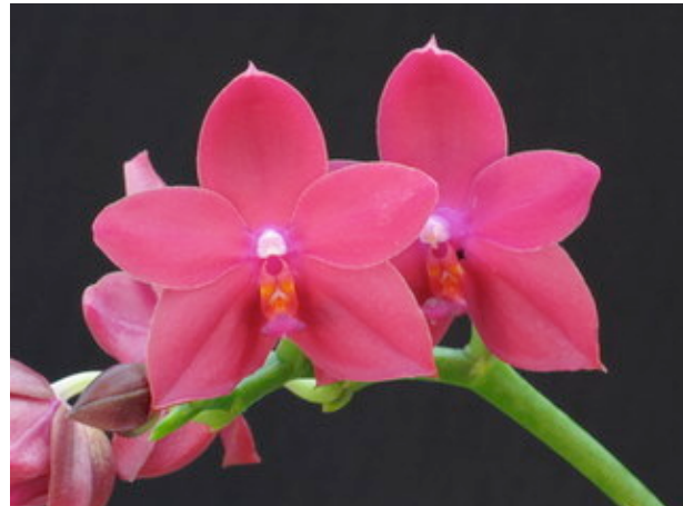
Phal Plantation Garnet Fire 'Orchid Konnection' AM/AOS