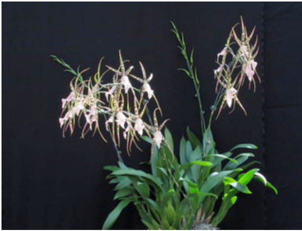
Miltassia Leopard Glo 'Carol Stauder' CCM/AOS Best Grown Plant in Show