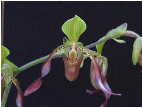
Paph Robinianum 'Da Vila' HCC/AOS