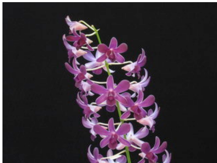
Dendrobium Blue Violetta 'Robbie's Blue Dream' AM/AOS