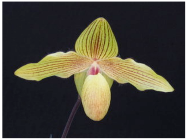
Paph Dollgoldi 'Carol's Surprise' HCC/AOS