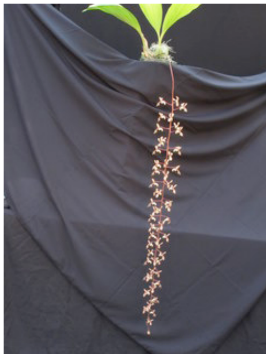
Gongora scaphephorus 'Susana' AM/AOS